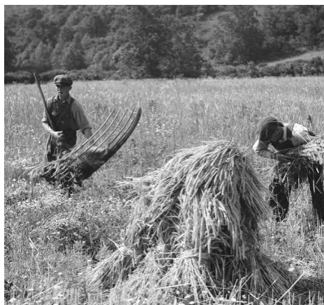
Historical but not Austerlitz.

For many of us the lyrics in Nat King Coles song , “Those Hazy, Lazy, Crazy, Days of Summer.” capture the essence of summer. Though there may still be much to do, we tend to relax more, enjoying barbeques, swimming and vacations.